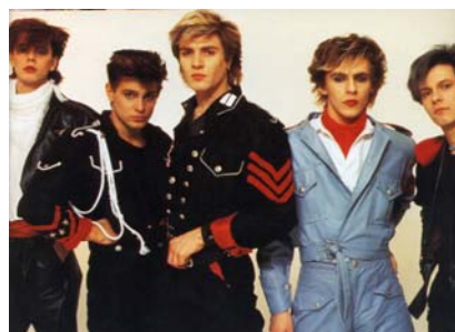
Duran Duran in the 1980s