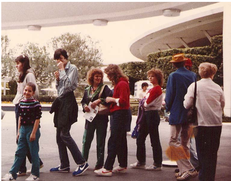
In line at Space Mountain, Disneyworld, 1983