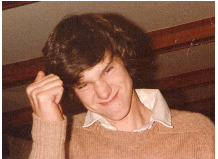
Rocking out to some mad air guitar circa 1983